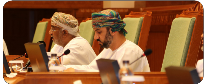
Side of Majlis A'Shura meeting