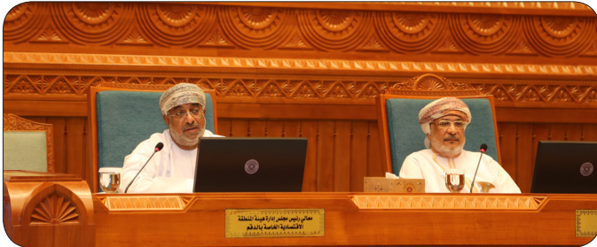
Side of State Council meeting