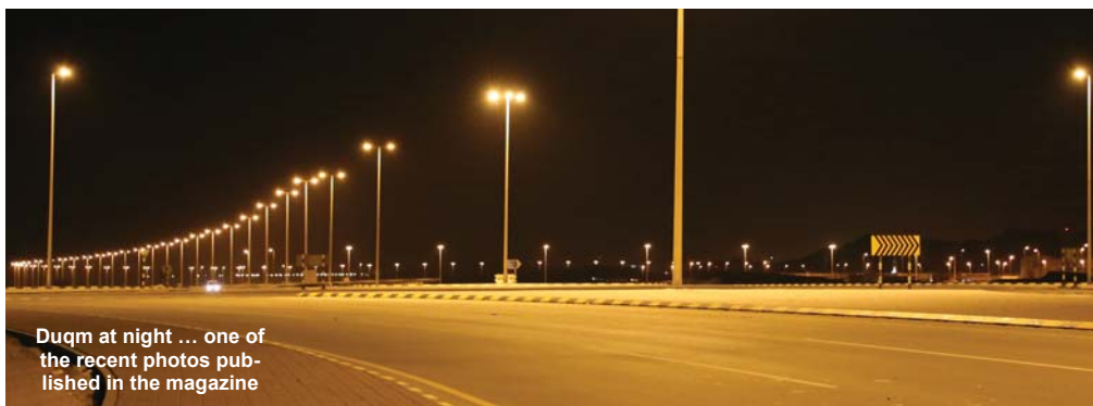
Duqm at night ... one of the recent photos published in the magazine

Misbah Qutb calls for cooperation between "Suez and Duqm" and establishment of an Arab union for special economic zones