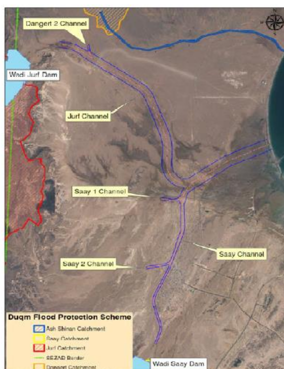
FIGURE 2: JURF AND SAY DAM LOCATION