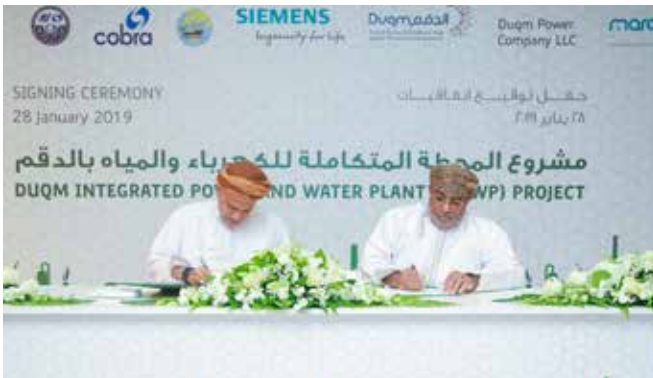
Signing usufruct agreement for the construction of Duqm Integrated Power and Water Plant - 29 January 2019