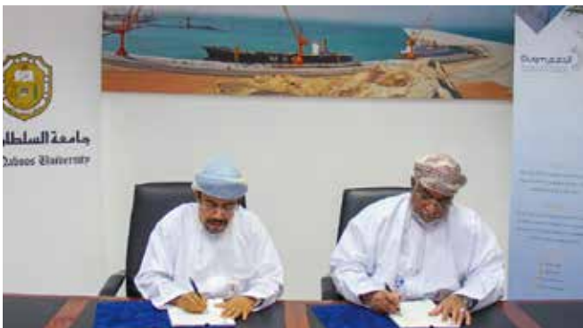
Signing usufruct agreement with SQU to establish research centers in Duqm - 21 May 2019