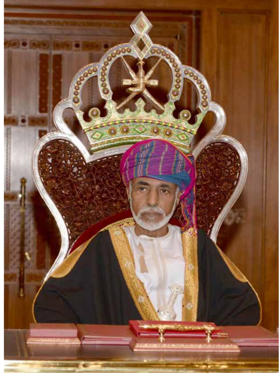
His Majesty Sultan Qaboos bin Said