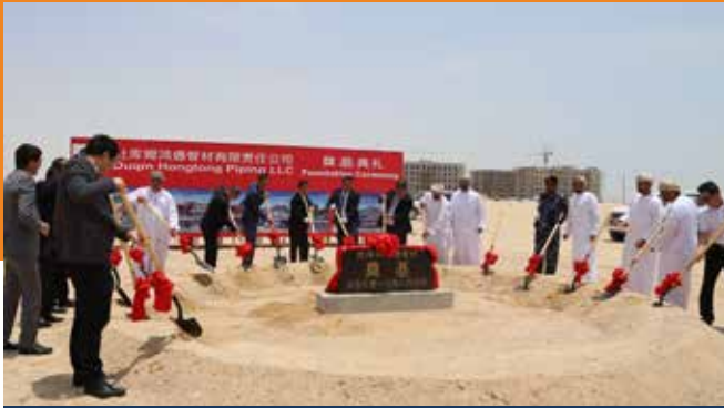
Groundbreaking of Duqm Hongtong Piping Factory for manufacturing non-metallic pipes - 6 August 2019