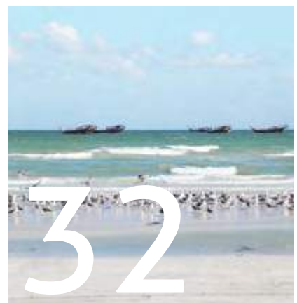
Industrial Fisheries Zone: Harvesting the ocean's bounty