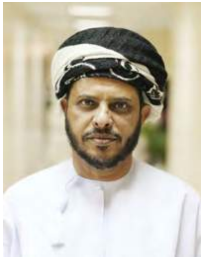
Sheikh Salam bin Saqat al Junaibi Member of Majlis A' Shura from the Wilayat of Duqm

"The Duqm Fishing Port will also meet the needs of the locals and create a major source of income. The project, which has been included in the development projects for the area, include a marina for receiving