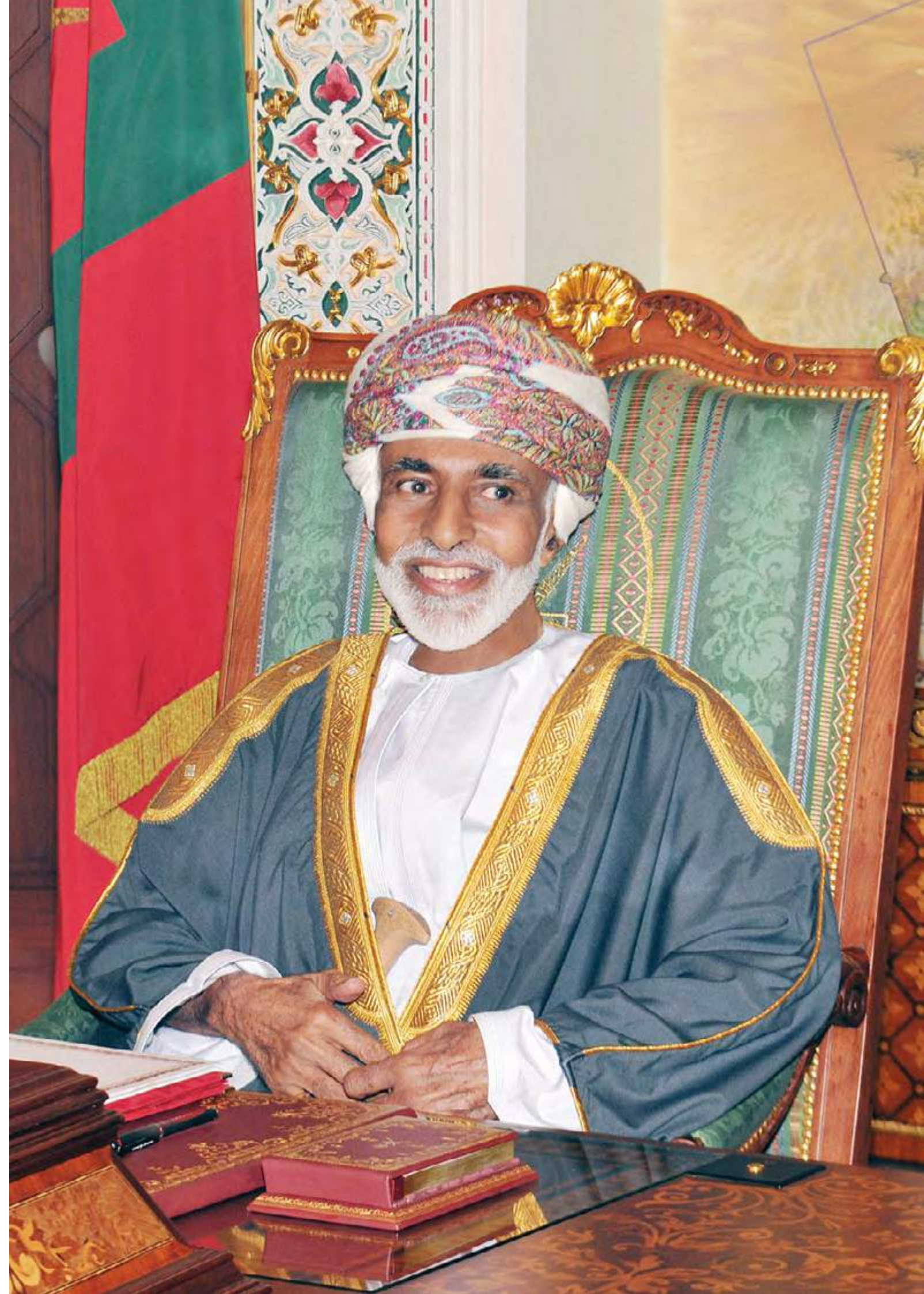
His Majesty Sultan Qaboos bin Said