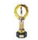
HM's Trophy for the Best Five Factories 1997

Associate Companies: Darwish Polycon L.L.C. | ELITE Supply of Manpower | Fajar Pioneer Trading L.L.C. | Gulf Retreading Solutions L.L.C. | Lujaina L.L.C. | MHD Avon | MHD Engineering & Contracting L.L.C. | MHD Infosys L.L.C. | MHD Infotech L.L.C. | MHD Invesco L.L.C. | MHD Logistics L.L.C. | MHD Training Institute L.L.C. | Special Engineering & Construction Company L.L.C. | Special Oilfield Services Company L.L.C. | QATAR: United Cooperation for General Trading W.L.L. | UAE: MHD L.L.C., Dubai | Fajar Pioneer Trading (FZCO), Jebel Ali.