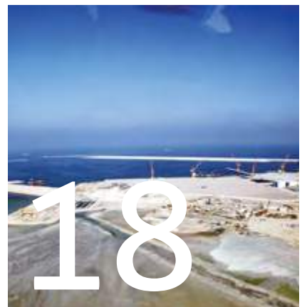
Port of Duqm Company Era of container shipping is nigh