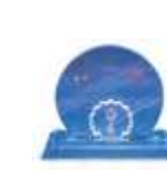
HM's Shield of Excellence for the Best Five Factories 2007