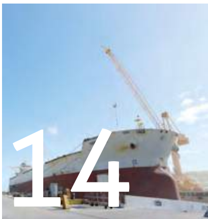
Duqm SEZ Infrastructure Underpinning a mega logistics hub