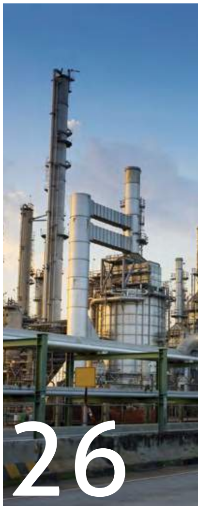
Oman Oil Company SAOC: Anchoring Duqm's long-term growth