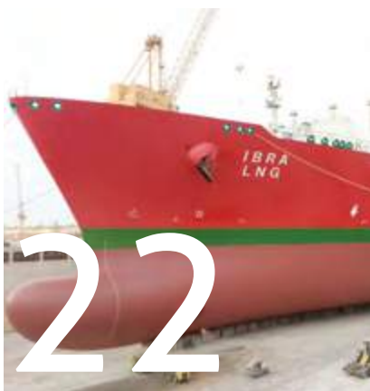
Oman Drydock Company SAOC Middle East's premier pit-stop for ship maintenance and repairs